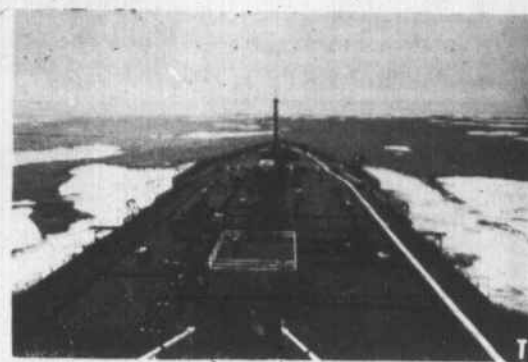
The S.S. Manhattan sails through temperatures of 50 degrees below zero.

In preparing for the recent voyage of the S.S. Manhattan through the "ice-olated" Northwest Passage to the newly discovered oil field of northern Alaska, Humble Oil, sponsor of this history-making mission faced up to the task of compensating for conditions which included temperatures of 50 degrees below zero for weeks on end.