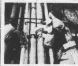
Special insulation is required to protect pipes.

Because the first exploratory voyage did not entail returning with a cargo of oil, only the essential deck piping was insulated to maintain required services. A factory-assembled system, consisting of external aluminum jacketing, vapor barrier and Thermobestos insulation was snapped over bare pipe and held in place with straps and stainless steel bands. Called