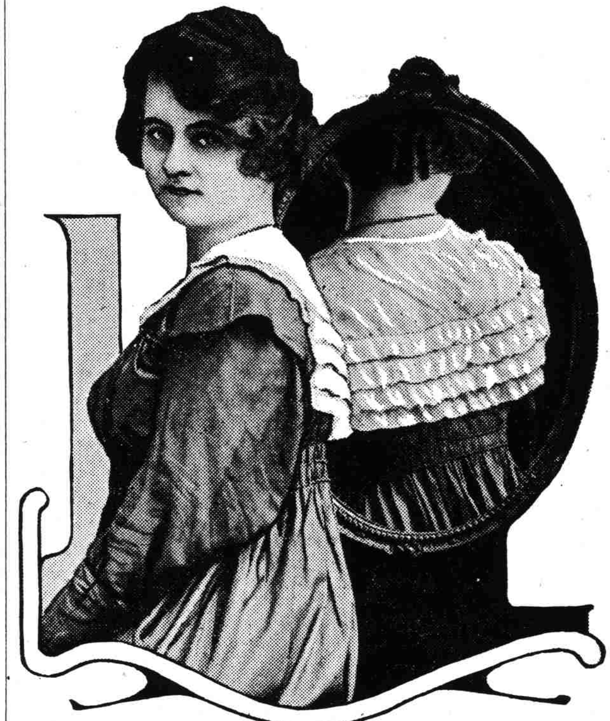
Neckwear That Fashion Approves.

The silk bodice is made in the "slip-over" fashion and joined to the skirt with a piping of silk. The waistline is a little higher in the back than in the front and this improves the lines of the figure for either slender or heavy figures. The bodice is decorated with very narrow folds of silk, set on in triangles at the back and front, and the collar merits special attention because it is new and popular and harmonizes so well with the shape and decoration of the bodice. The crepe is cut in long triangular pieces at the back and front and finished at the edges with a narrow hem. A pendant tassel is set on with a crochet button to each point. The plain sleeves are set into deep, turn-back cuffs of silk, and the bodice has a shallow "V" opening at the front of the neck. This model, pretty and unusual as it is, is simple in design and easy to execute. The master hand in designing is required to achieve such fine results of such easy methods.