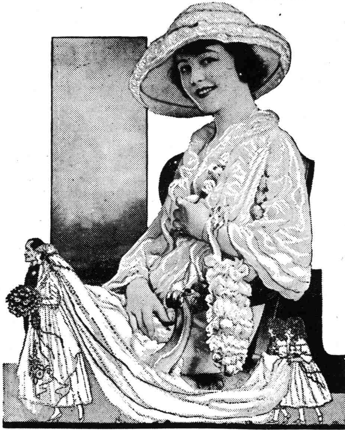
Consider the Maid of Honor.