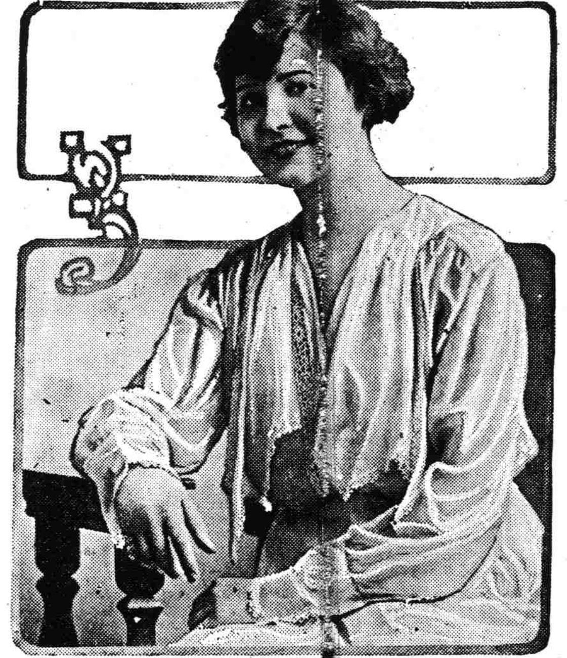
About the New Blouse.

hats and the rule is for simplicity in quite independent of these ideas. Except for lingerie blouses and plain shirtwaists, much like those of the pioneer days in blouses, the new models enter-a brilliant and vivid company, in colors and decorations, compelling the eyes. They save the day band which is hemstitched to a narfor a season that would otherwise be too tame.