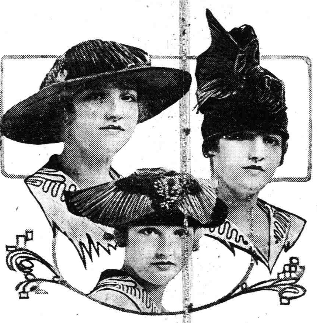
Velvet Hats for Fall.

"I'm blest if I know what you women want with dressmakers nowadays; cut shole for your head in a piece of stuff and tie it in around the waist and there you are!" So said a smart soldier man on leave, whose own univoile or batiste or organdie, with the mind to follow your directions and finest voiles favored. They are not take a walk in the park with you," by any means inexpensive when the countred his wife. It is difficult to work of making and decorating them is | see where the modiste's skill comes all done by hand as it is in the best in, for the gowns of today fit nowhere examples of this kind of blouse. Mi- and disguise rather than improve the nute, hand-run tucks, inlays of real figure. All the same, the costume lace and embroidered applique, worked turned out by a first rate house has by hand, bring prices ranging from a style about it indefinable, but unmis-