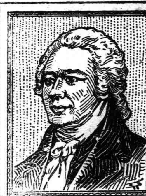
Alexander Hamilton First Secretary of the Treasury