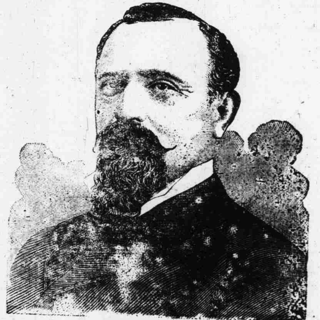
W. C. COUP TO THE PUBLIC.