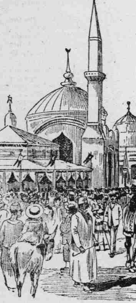
THE MIDWAY PLAISANCE FROM THE EAST.

Then, too, there is a whole multitude of displays quaint or curious from some point of view that illustrate matters other than the manners of the orient or the lack of them in Africa. Things industrial are not forgotten and the savage braves over on Frank avenue are soothed by the charms of music rich and rare. Visitors who stroll into a glass factory, blaze as they may be with the marvels of the exhibition, are startled by finding themselves in close proximity to a Turk or two, a German cavalrman, a Tyrolean singer, a French danseuse, and a Chinese hieroglyph. These are the daily occurrences of the Midway Plaisance. In deference to the railway bridge that crosses Midway Plaisance the street