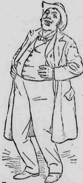
THE MAN WHO LAUGHS -HE IS PLEASED AT- OUR OFFER.

Because There is Money in it For You and Money Is what you Want.