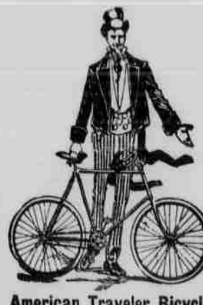
American Traveler Bicycle

oppearance. You can tell them anywhere. It's a secure of beauty and strength. It has more real nertal improvements than any high-grade Bicycle to the market. BUILT BY American B. H. O.