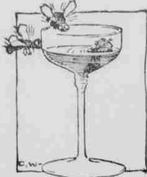
"THE MOST DEADLY ANIMAL ALIVE."

There is a belief among some people that flies are useful because they feed on wastes. No greater mistake could be made. Flies light on and walk over all manner of unclean matter, and then spread germs and uncleanness over dishes, food, and milk vessels. They may come to our faces straight from feeding on the spectrum of a consumptive or the wastes of a typhoid patient. They may fly directly from some one who has sore eyes to our hands or faces or to the very eyes of a little baby that cannot defend itself from them. There is nothing more dangerous or more unclean than to live among a swarm of flies.