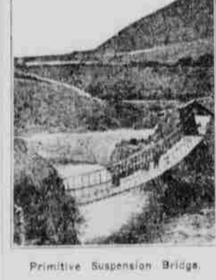
Primitive Suspension Bridge.

London.—The curious suspension bridge shown in the accompanying engraving was built by the native Indians of Peru, says the Scientific American. It may be found across the mountains from Lima, in the Huancayo valley, near Huay, spanning the Huari river. Being a mountain stream, subject to sudden torrential floods, substantial towers have been built at each side, which provide secure anchorage for the cables and raise the floor of the bridge well above