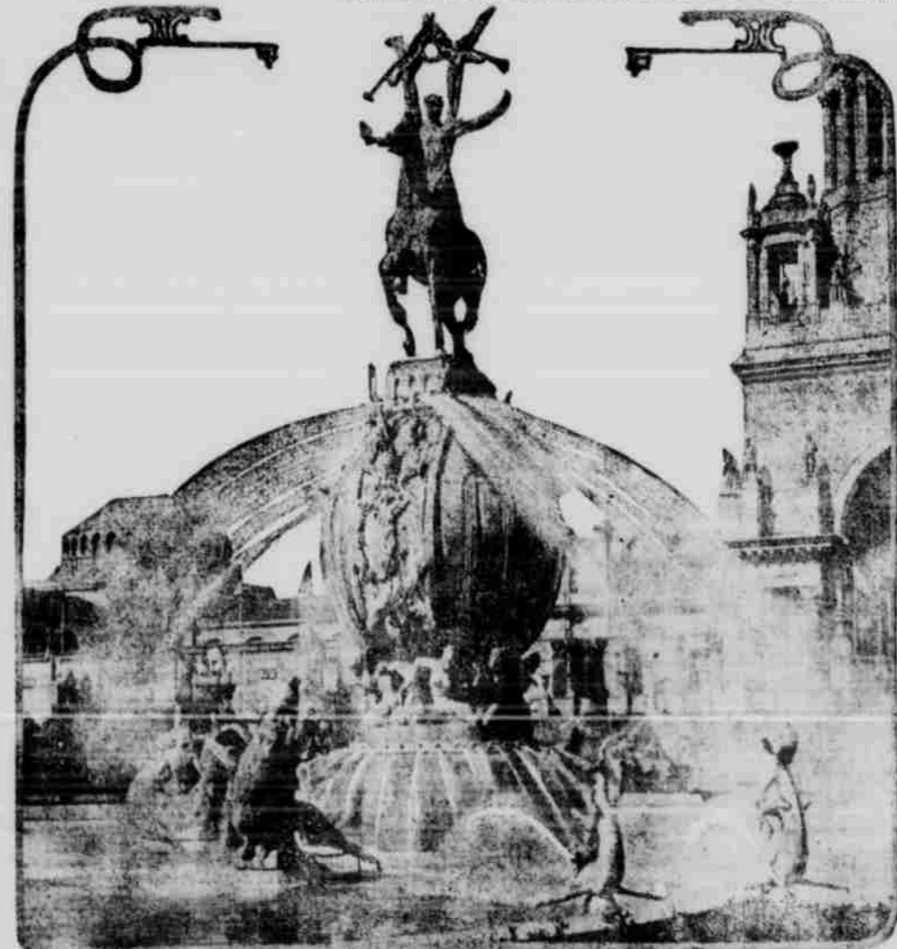
The labor that went into the building of the Panama canal is symbolized in the Fountain of Energy, by A. Stirling Calder. This heroic sculpture stands in the center lagoon of the three lagoons of the South Gardens and faces the main entrance gates. The waters were first released on opening day, February 20, coincidently with the opening of the portals of the exhibit palace and by the same means, the electric spark transmitted across the continent when President Woodrow Wilson opened the great exposition at San Francisco by wireless.