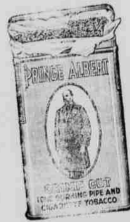
On the reverse side of this tin the red you will read, "Patented July 20th, 1907," which has made Prince Albert a success where ever smoked before!