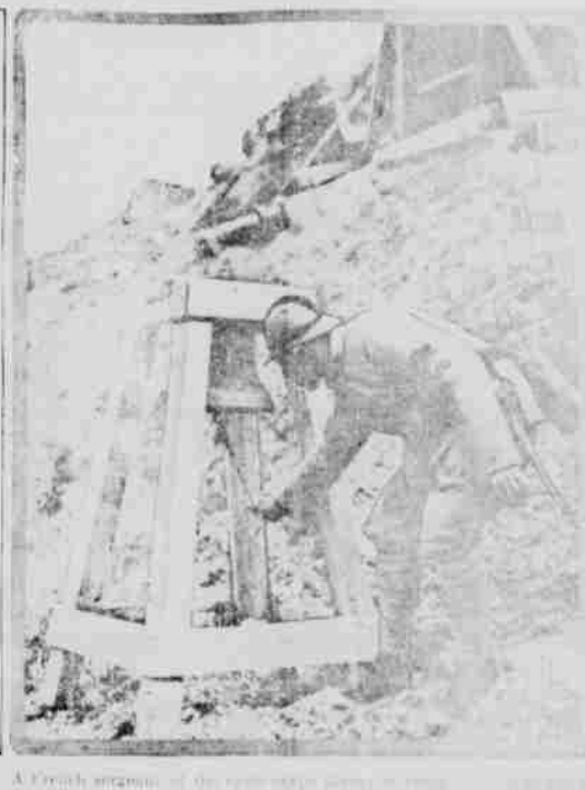
A French sergeant of the 1st Infantry Division is helped by his comrades during a gas attack by shelling a hill between two communication trenches.