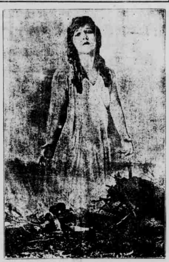
(Poised by Mary Pickford)