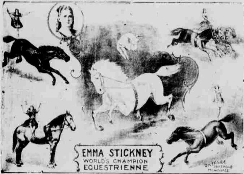
EMMA STICKNEY WORLD'S CHAMPION EQUESTRIENNE

See Royal's Famous Herd of Performing Elephants Who have delighted the hearts of thousands of spectators.