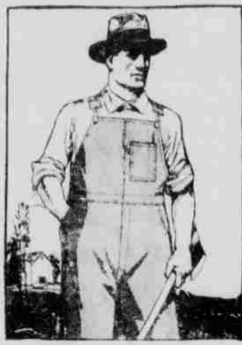
"I've tried a lot of overalls, but at all I've worn, give me Blue Buckles every time. They always give long wear."