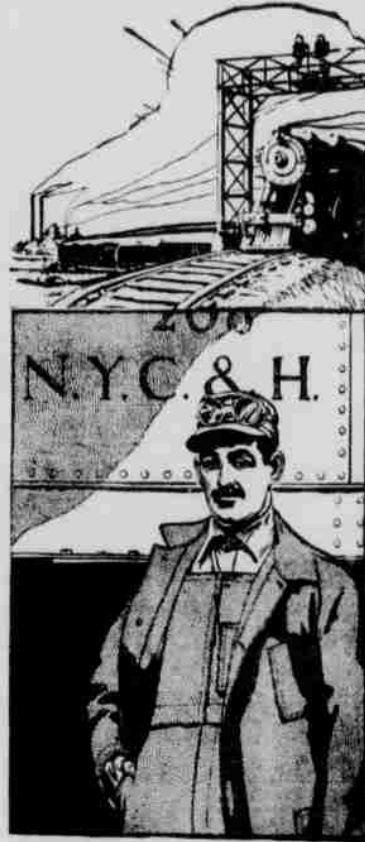
"I wear Blue Buckles on every run. They're tough as raw hide and fit easy all the time."