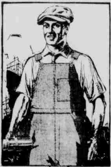
"There's heavy work at the shipyards. That's why I stick to Blue Buckles. They're sure to give long wear and comfort."