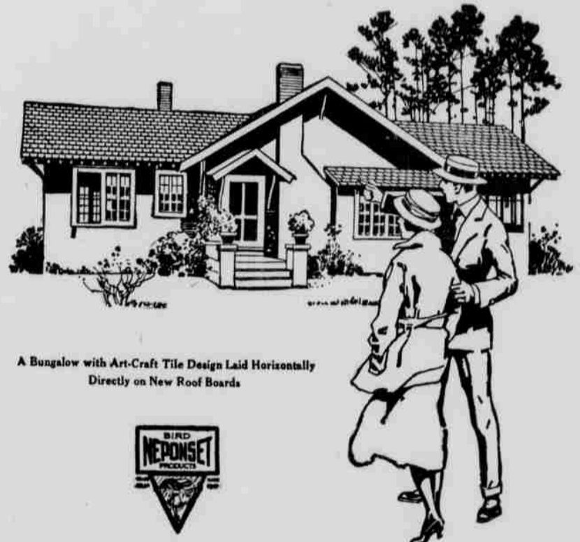
A Bungalow with Art-Craft Tile Design Laid Horizontally Directly on New Roof Boards