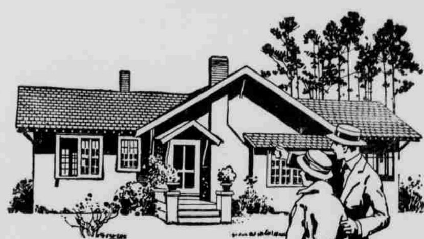
A Bungalow with Art-Craft Tile Design Laid Horizontally Directly on New Roof Boards