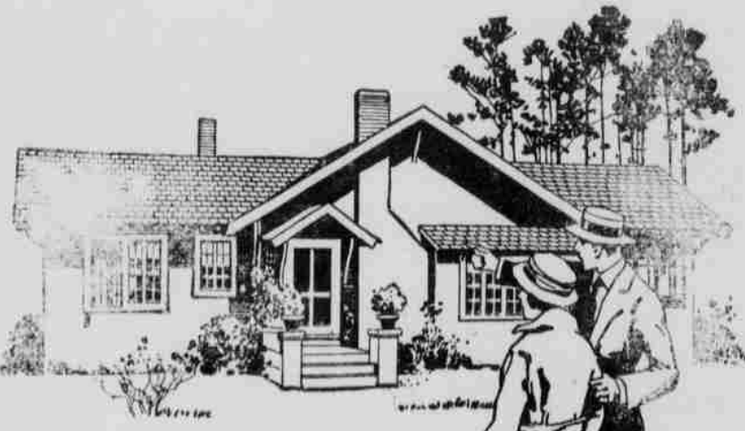
A Bungalow with Art-Craft Tile Design Laid Horizontally Directly on New Roof Boards