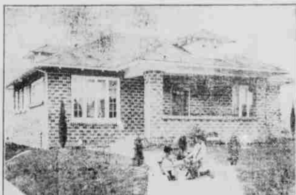
The Kreta—Design A-223

This illustration shows a single story detached dwelling of the new type with the Ideal wall, the new type of hollow brick which has replaced the old solid brick. The new wall is built with the Ideal wall, the new type of hollow brick which has replaced the old solid brick. The new wall is built with the Ideal wall, the new type of hollow brick which has replaced the old solid brick.