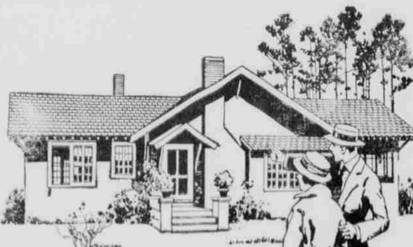
A Bungalow with Art-Craft Tile Design Laid Horizontally Directly on New Roof Boards