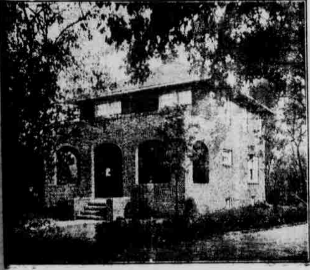
The Oneida, Design No. 10