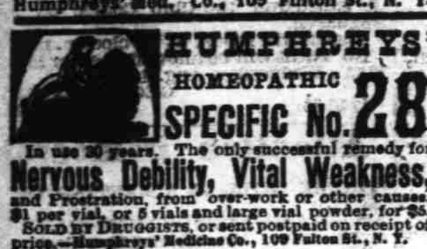
table Case, with Specifics, Manua Witch Hazel Oil and Medicator, ngle Bottle (over 50 doses), Sold by Druggists; or Sent Prepaid on Receipt of Price-mphreys Med., Co., 109 Fulton St., N. Y.