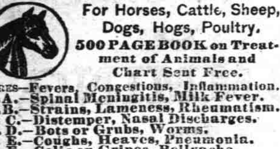
Chart Sent Free. CURES-Fevers, Congestions, Inflammation. A.A.-Spinal Meningitis, Milk Fever. B.B.-Strains, Lameness, Rheumatism. C. C.-Distemper, Nasal Discharges. D. D.-Bots or Grubs, Worms. E. E.-Coughs, Heaves, Pneumonia. F. F.-Colic or Gripes, Bellyache. G. G.-Miscarriage, Hemorrhages. H. H.-Urinary and Kidney Diseases. I. I.-Eruptive Diseases, Mange. J. K.-Diseases of Digestion. Stable Case, with Specifics, Manual. Stable Case, with Specifics, Manual Witch Hazel Off and Medicator, S Price, Single Bottle (over 50 doses). -

HUMPHREYS' HOMEOPATHIC VETERINARY SPECIFICS