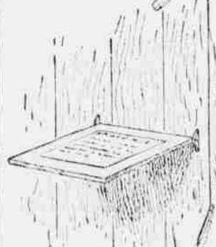
SCALE FOR THE RECORD SHEET.

Planted Onion Culture. Onions, like some other farm crops, require a large amount of labor to give the best results.