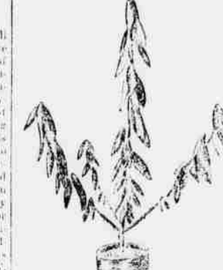
THE CLOCK PLANT.

The clock plant is a native of Bolivia and it is said that it is in other parts of the world. The clock plant has a number of peculiar habits. From which it takes its name. It is as sensitive to the touch of human fingers as the most sensitive plant.