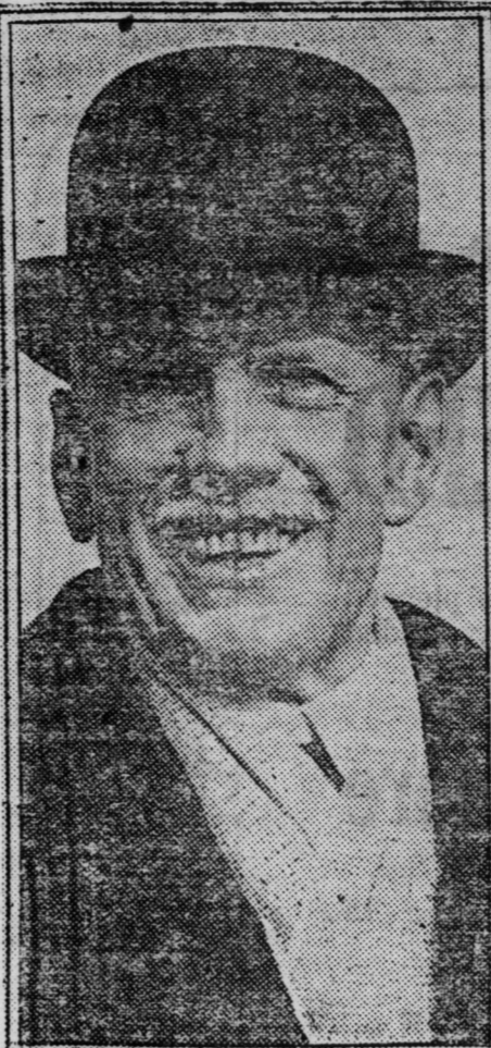
COMMANDER COMES HOME.

J. P. COULTER CO. Jewelers, SANFORD, N. C.