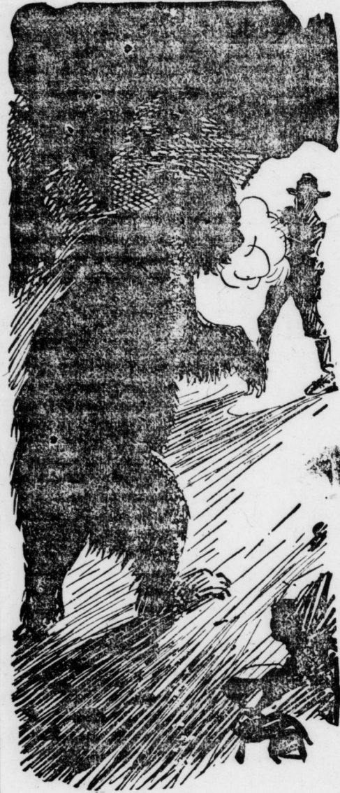
Fired Two Shots.

Malone, N. Y.—If you had tracked a big bear to his den among mountain rocks and Bruin laughed at you and refused to come out and be killed, what would you do? Leave him to himself and look for him another day? Or would you crawl in after him as Old Put crawled in on one memorable occasion and bearded a