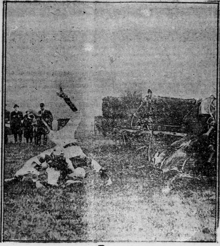
HORSES AND JOCKEYS TANGLED IN STEEPLECHASE SPILL.