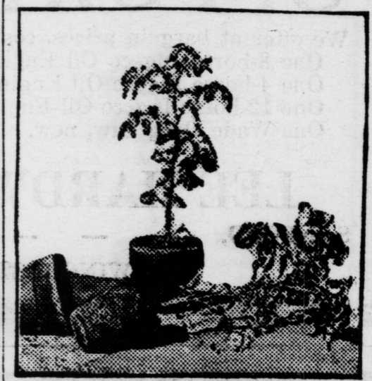
The Pot-Grown Plant.

The transferring process should be begun with the stronger plants in the thage. flats when they are about one inch high. Select the best plants for transplanting. The flat should be