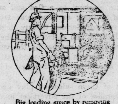
Big loading space by removing rear seat and upholstery.

WE have never seen a car the way they are flocking to the new Overland Champion! It's a revelation—how much they wanted such a car! Study these pictures—you'll understand. Then realize that the low price also secures the best of all standard accessories—better new engine, Triplex springs, cord tires, and all Overland superiorities. Come in.