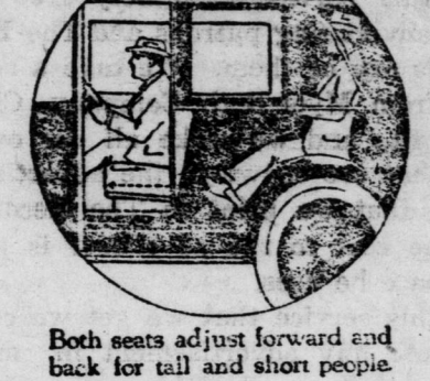
Both seats adjust forward and back for tall and short people