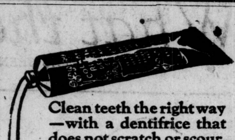
Cartoon from The Farm Journal, June 1923

Clean teeth the right way — with a dentifrice that does not scratch or scour. "Wash" your teeth clean with