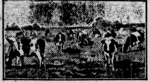
This Also Was Desert Once

for better conditions next season. Nowadays, if the rainfall does not suit him, he produces his own rainfall by a twist of the wrist, or the push of a button, in exactly the quantity he desires, and at precisely the time it is needed. Furthermore, he puts it on the particular piece of ground which he wishes to cultivate. The application of electric power to irrigation, through the rugged electric motor, has simplified and economized the process for the farmer,