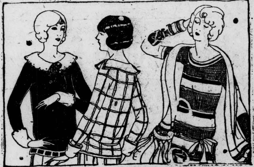
CHILDREN'S AND MISSES' DRESSES.

This week and for Easter selling we will feature Special values in Childrens' dresses. Sizes 6 to 14. Cotton Pongee, Linen and Everfast prints. Prices