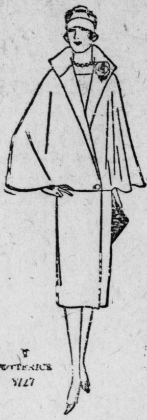
Capes as well as the major part of an ensemble, the minor theme of a frock or the upper cut of a coat are tremendously chic.

Paris tops the new modes with capes—long capes that take the place of long coats, short capes worn instead of jackets, shoulder capes that do nothing practical but make a fine sartorial gesture. In the French coat illustrated the circular cape takes the place of sleeves and body, while the lower part is attached to it at the front and back. This is an excellent coat for the home and it takes a little material and is very easily made. The original French coat was made of cashmere with a pale, pinkish flower on the lapel.