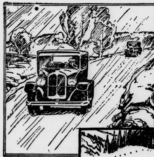
Testing a car's performance in heavy rain. From actual photograph.