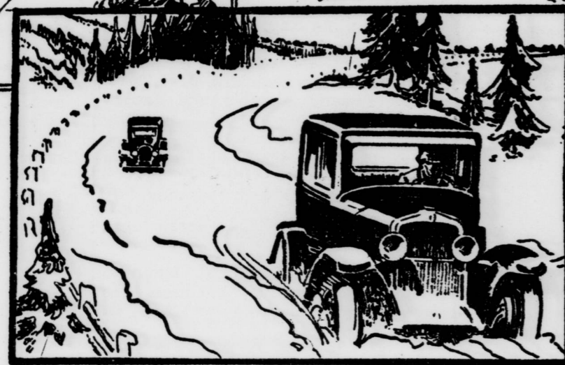
Drawn from a photograph of a car being tested on snowy roads.

VISITORS to General Motors' 1268-acre Proving Ground marvel at the sight of a complete weather bureau and ask what it is for.