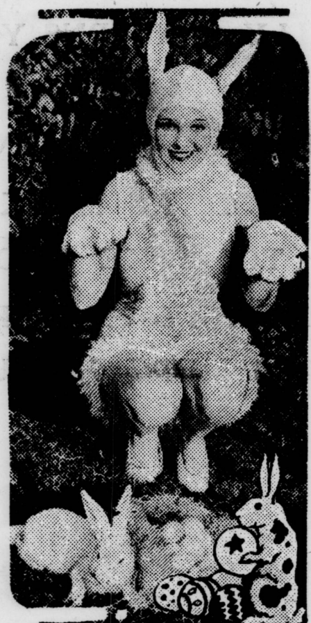
Who said rabbits don't lay eggs? This young lady seems to have a bit of weighty evidence to prove that they do.