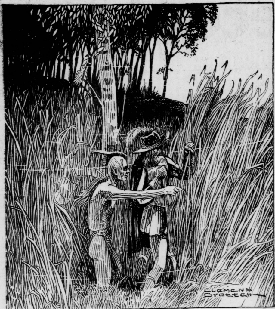
Ponce De Leon looking for the fountain of youth. He discovered and named Florida in 1513. Find the way he imagined himself to be after bathing in the fountain.