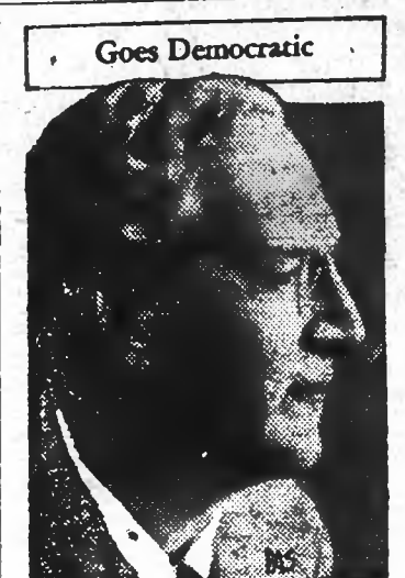
Upton Sinclair, famous author and socialist, announces he will change his California registration to that of Democrat so he may run for governor on an "epic plan" platform.

The necessary money to pay for the marker and other incidental expenses was turned into The Journal-Patriot without any solicitation whatever and the