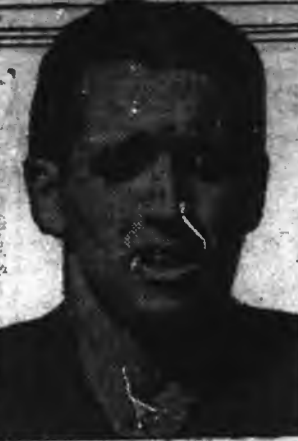
MILAN, Italy... Luigi Beccali (above), Olympic 1,500 Meter Champion, will go to the U. S. in June to compete in the Princeton University meet.