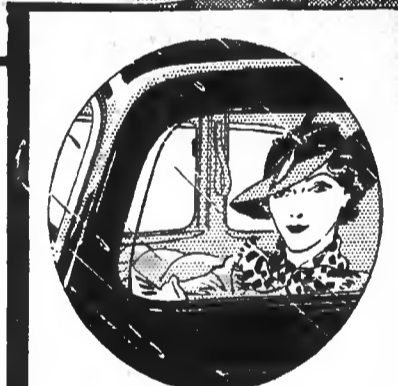
FORD CLEAR-VISION VENTILATION banishes the "blind spot" forever. Each window is in a single rattle-proof piece.