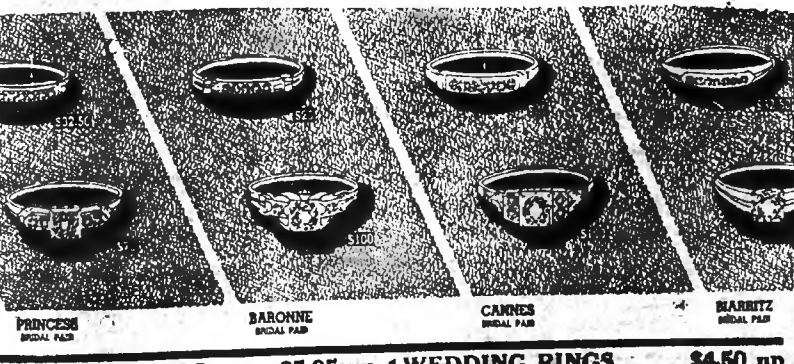
DIAMOND RINGS ..... $5.95 up | WEDDING RINGS ..... $4.50 up

15 jewel semi-roulette, gold filled case. $37.50 17 jewels. 14 K natural gold filled case. $47.50