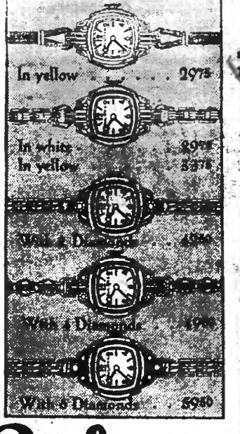
A great watch value... a 17 jewel Bulova at this amazingly low price!

For the first time! THIS 17 JEWEL Lady Bulova Only $29.75