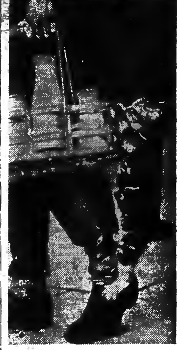
Almost as contented as a cat in a creamery, this kitten has learned to meet the London milkman at the garden gate in this amusing fashion and get a lift back to its home.