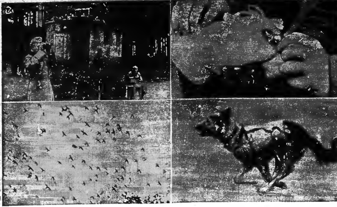
Trained to supplement more modern means of communication, pigeons and dogs are being used by German army officers to send messages where the modern means fail.