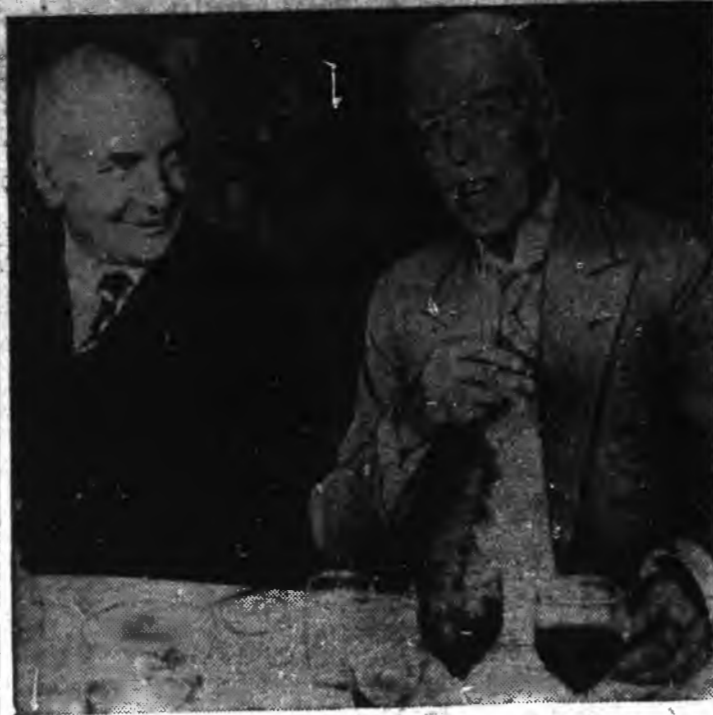
King Gustav of Sweden, right, with his premier, Albin Hansson, discuss the results of the recent Copenhagen conference between Norway, Sweden and Denmark. The foreign ministers of the three countries voiced hopes for a peaceful solution of the Finnish-Russian war and decided their own countries would continue their policy of neutrality in Europe's wars.