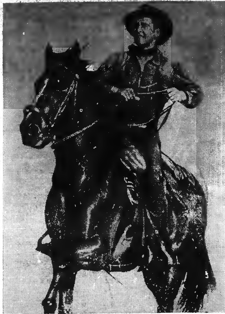
RIDIN', ROPIN', SHOOTIN'—Errol Flynn has his most glorious screen adventure in "Virginia City", Warner Brothers mighty picture of a roaring chapter from the history of the west in gold-rush days.