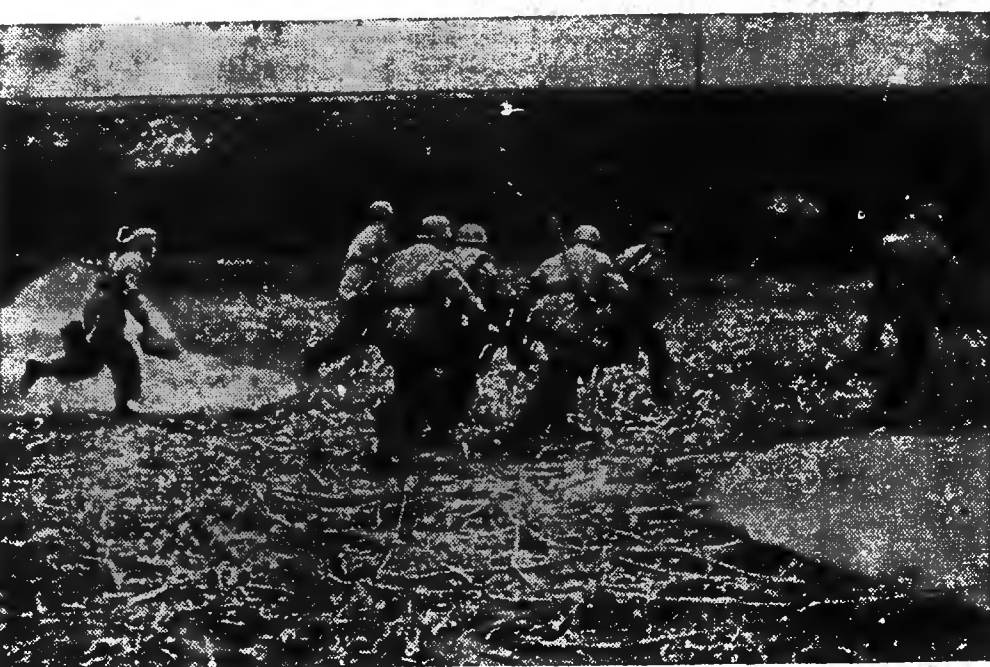
The Nazis' highly effective parachute troops, which have so materially helped the success of the German drive, are pictured in action here. Men of this detachment have just been dropped from a Nazi transport plane. They have discarded their parachutes, assembled their heavy machine guns, and are dashing for the protection of the strategic railway line which runs on the embankment in the rear.