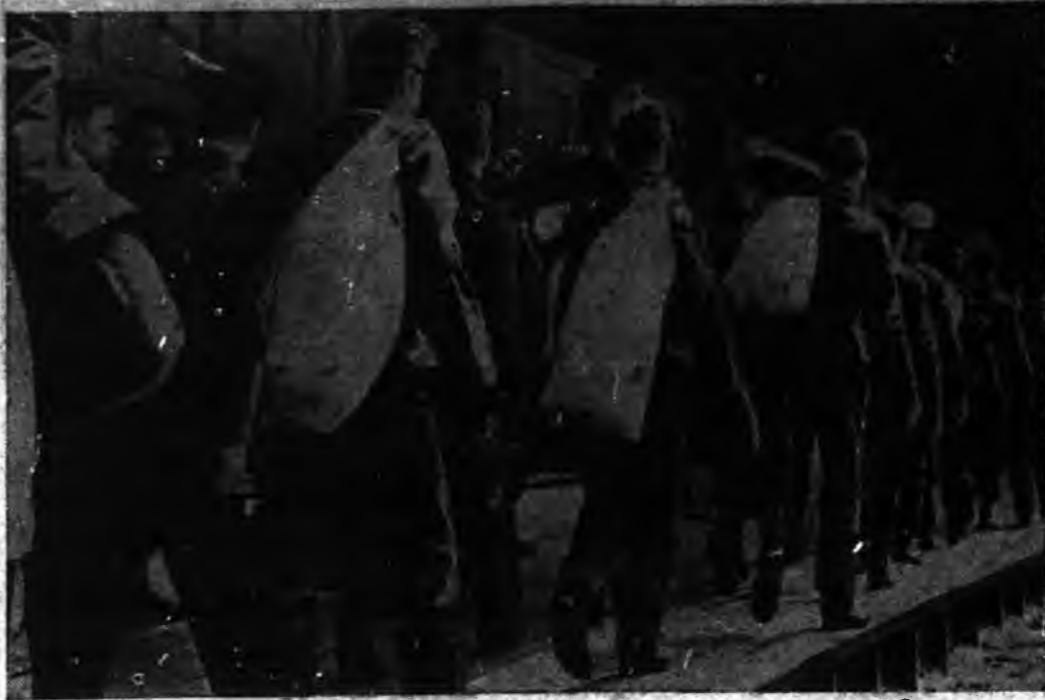
The Germans have landed in Canada, as the photo shows, and they came as prisoners of war and not as conquerors. The above detainees are shown marching through train sheds in Quebec, on their way to Canadian prison camps. Canada was regarded as an extremely safe place for these prisoners because they are all specialists, including air pilots, parachutists and navy men. Originally imprisoned in England, they were moved to prevent danger during Hitler's attack on England.