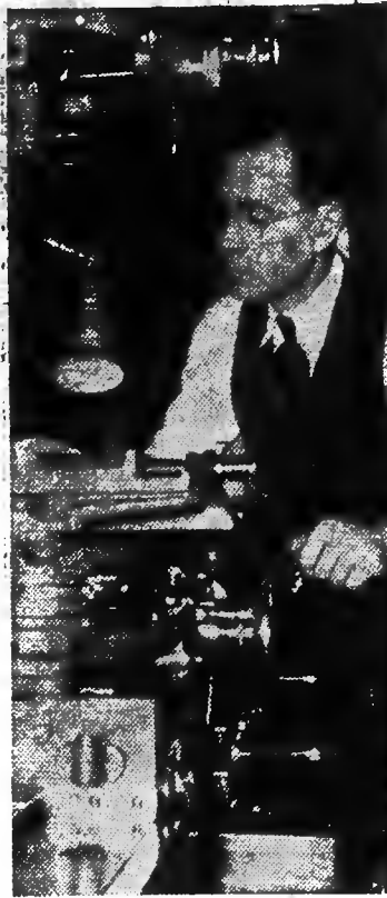
John C. Garand, inventor of the army's famed semi-automatic Garand rifle, is shown at work in his model shop at the Springfield, Mass., armory, where his grand gun is in mass production to arm our defense forces.