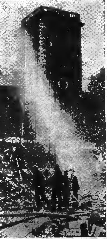
British firemen pouring a stream of water on the still smoldering St. James church, historic London landmark, following a German air raid on the British capital. This picture approved by British censors.