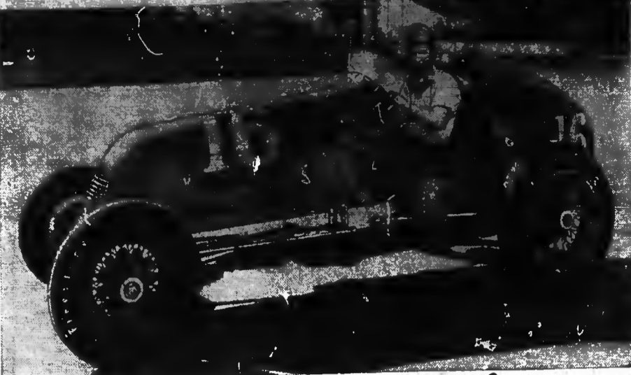
Mauri Rose, co-winner with Floyd Davis of the 1941 Indianapolis 500-mile race, is pictured above in the American-built car which he drove to his first speedway victory. His car forced out of the race at the 155-mile mark, Rose took the wheel of the car driven by Floyd Davis, and took it from 15th place to first place, averaging 115.117 miles per hour on the same set of Firestone Tires that were on the car when the race began.

Driving his teammate's car from 11th place to a spectacular victory in one of the most dramatic races ever held at the historic Indianapolis Speedway, Mauri Rose won his first 500-mile race on May 30. Starting the race in the coveted pole position by reason of his highest qualifying speed of 128.691, Rose was well up with the leaders when his car developed engine trouble after 155 miles and was forced out of the race. Lou Moore, owner of the car which Rose had been driving, asked Rose to relieve Floyd Davis, who was driving another one of Moore's cars and Rose drove to victory at an average speed of 115.117 miles per hour without a tire change or tire trouble of any kind. This was the 22nd consecutive year that Firestone Tires have been on the winning cars in this great race. One by one, Rose passed the