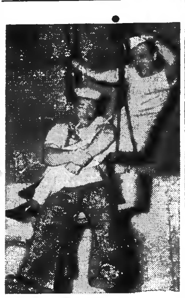
Lou Costello and Bud Abbott in University's Navy life comedy. Starts today at the Allen.