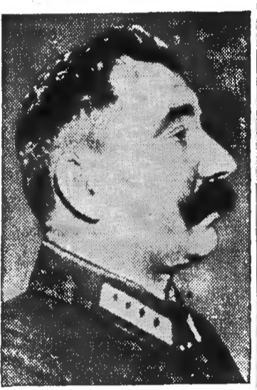
Marshal Semeon Budenny, commander of Russian armies operating on the southwestern front, who led the Red counter-attack which in some sectors threw back the German advance.

vehicles so classified by law. (b) Operation of vehicles necessary for the public health and safety, including ambulances and vehicles operated by doctors. (c) Operation of farm machinery and motor trucks for farm purposes. (d) Operation of vehicles owned or operated by federal, state or local governments.